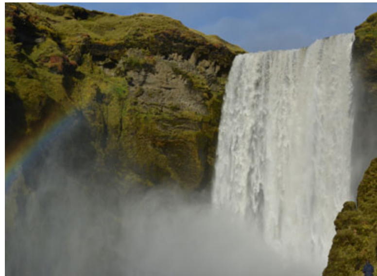
Taken during a Geography trip to Iceland - a fantastic way for our students to gain an invaluable experience which illuminates textbook concepts and sparks a lifelong love of learning.

There are a remarkable number of careers which involve Geography: town planning, environmental monitoring, marketing and leisure management and the production of computerised maps of many kinds. Many of those who study Geography, however, will choose careers in finance, management or some other unrelated area. The wide range of skills acquired in the subject (together with the overall 'roundedness' of the student) will always be an attraction to a potential employer.