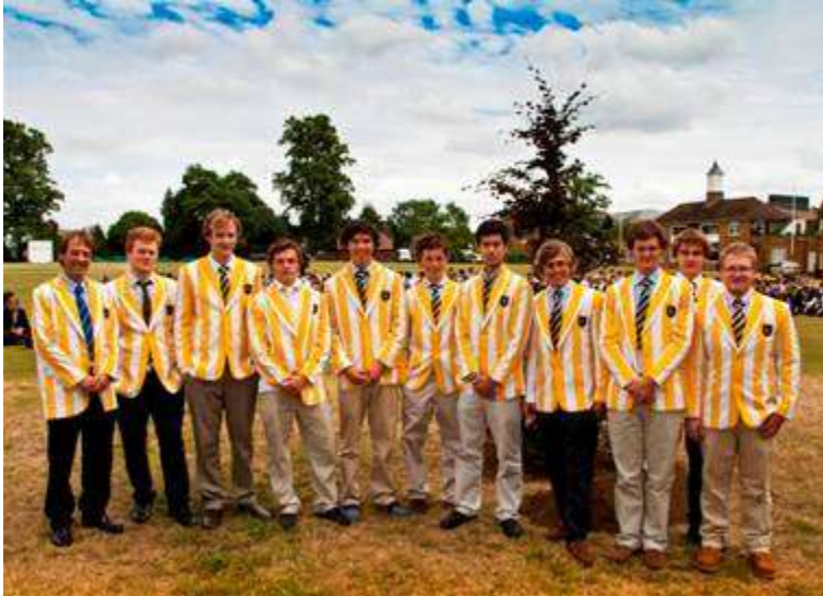
This year's departing U6th in their leaver's jackets