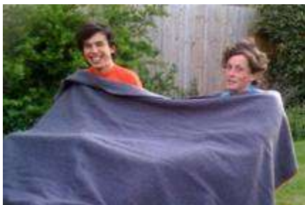
Two hardy U6th at the leaver's barbeque